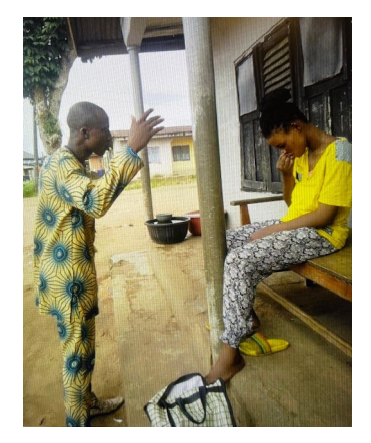
prayer God preserves and helps them grow to spiritual maturity.

attend the discipleship training organized by the Christ Foundation Liberation Ministry. We know heaven rejoices over a single soul that comes to light. So we have a reason to glorify God. It is our